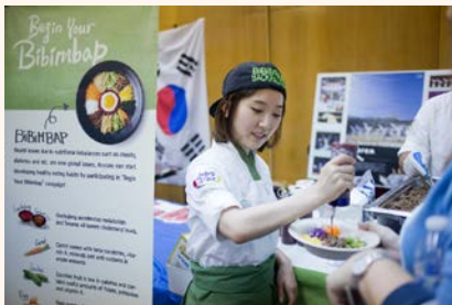
Event Highlight: Bibimbab Mixed Vegetables with Beef and Rice

PECG Sacramento Section was a major sponsor of the Caltrans 2014 Diversity and Disability Awareness Day (2014 DDAD). This event was held on September 23, 2014, in the Caltrans Translab. Eight countries had participated and it was deemed a very successful event.