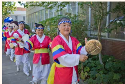
Korean Street Dance was performed