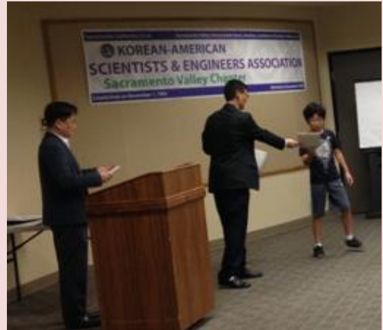
Presenting a certificates to winner