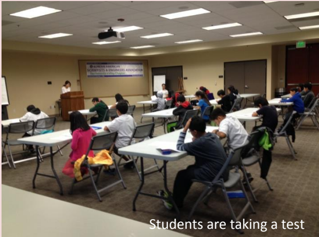
Students are taking a test