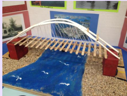
Bridge made by chop sticks, Ice Bar sticks