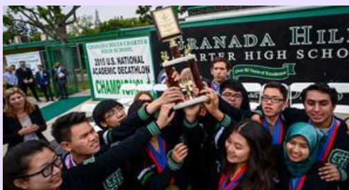
Granada Hills Charter Brings Home the Gold

Saturday, March 21, 2015, Memorial Auditorium