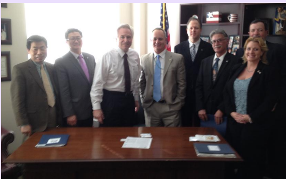
With Senator Jim Nielsen (R) -white shirts-

Several PECG officers and committee members from the Sacramento section participated in the 2015 PECG Legislative Day, on March 3, 2015. PECG members personally sent messages to the State Legislators. The main subject concerned out sourcing, public inspection for public protects, public safety, Public-Private Partnership, new funding for State Highways, Healthcare, Environmental Engineering Licensure and more.